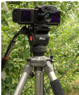
Fig.1. Dual-sensor vision system

Fig.1 shows a dual-sensor vision system, which includes a PMD Camcube3.0