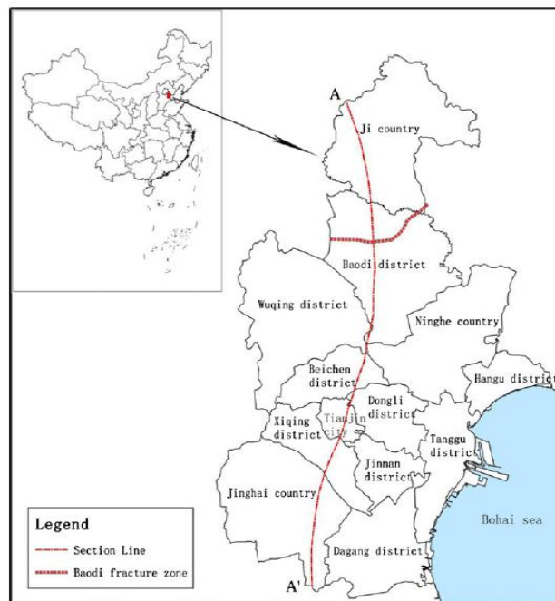
Fig.1 Location of the study area

Tianjin plain area situates in the eastern part of North China Plain, which covers an area of 11919km 2 . It is located in 116°42'05"~118°03'31"E and 38°33'57"~40°00'07"N. Tianjin plain is adjacent to the Bohai Bay in the east and leans against Yanshan Mountain in the north, shown in Fig.1. The terrain is higher comparatively in North West, and it becomes lower gradually to South East. It is dominated by semi-arid climate. The mean annual temperature is 12°C. The average annual precipitation is 580 mm.