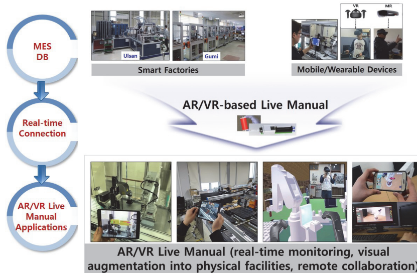
Fig. 1. Proposed AR/VR Live Manual for supporting various kinds of user-centric task assistance.

This paper proposes an AR/VR-based Live Manual to more effectively provide user-centric manufacturing services such as information visualization, monitoring, and sharing for task assistance and maintenance in the IoT-enabled smart factory environment. Fig. 1 presents the research goal and framework of the proposed live manual. We aim to develop an AR/VR-enabled mediator to workers in smart factory testbeds built in two cities such as Ulsan and Gumi, South Korea as shown in Fig. 1.