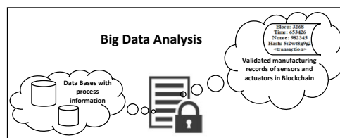
Fig. 2. Analysis of information by Big Data.

Once all the information has been stored, they can be analyzed in detail through Big Data. In Fig. 2 below, all the information from the validated and secure SCM processes by the blockchain platform as well as all the processes that have been stored in several databases, using Big Data technology, analysis of information can be carried out in order to obtain knowledge stored in the aid in the decision-making process.