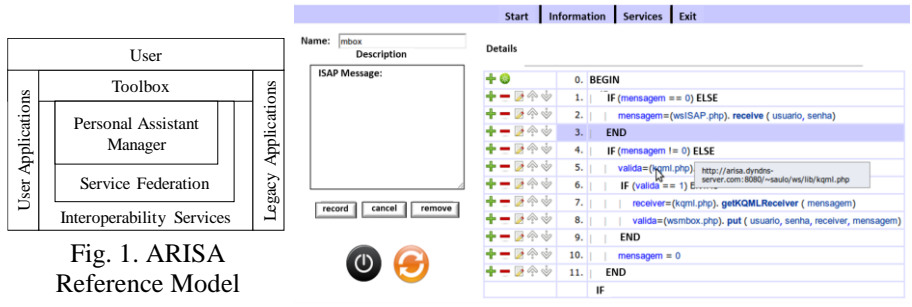
Fig. 2. Interface for the IPA Management

However, this supplier does not have the required total amount of parts and the IPA autonomously decide to look for another supplier. It finds the supplier 'Sora konpyuuta' company in the enterprise's supplier catalogue, but the cost of this transaction (for the 17 required additional parts) is $28.00. The Operator 4.0 - Mr. Saulo' is notified that there are 17 parts needed to be purchased, via an order '81', to complete the BP production.