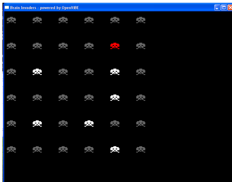
Figure 2. Interface of Brain Invaders during the first level at the moment where a group of six non-Target symbols flash (in white). The red symbol is the Target. The non-Targets which are not flashing are in grey.

The interface of Brain Invaders is composed of 36 aliens. In the Brain Invaders P300 paradigm, a repetition is composed of 12 flashes of pseudo-random groups of six symbols chosen in such a way that after each repetition each symbol has flashed exactly two times. Thus in each repetition the target symbol flashes twice, whereas the remaining 10 flashes do not concern the target (non-target), see Figure 2 . The ratio of Target versus non-Target is therefore one-to-five. A detailed description of this paradigm is available in (5,15,16).