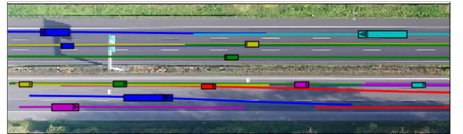
Fig. 2. Highway drone dataset highD [16]: recordings cover about 420 m of highway.

1) HighD [16]: a new dataset captured in 2017 and 2018. It is recorded by camera-equipped drones from an aerial