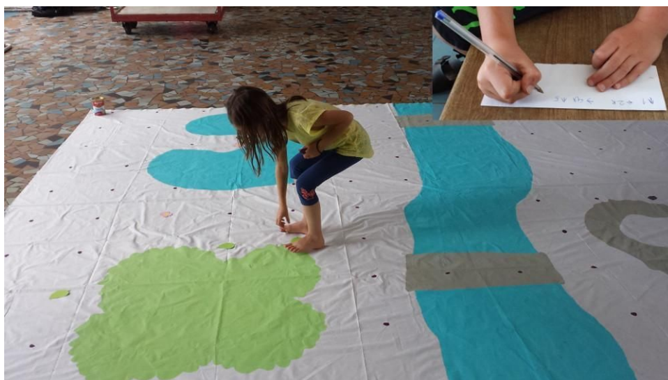
Figure 3. Robot game on a landscape created with a sheet.

In the activity proposed by Duflot (2016) 3 , before starting to program, the facilitators (teachers or science mediators) set up the environment in which the pupil playing the robot will move. Using a sheet can make it easier to set out a landscape or scene because it enables real obstacles (chairs, tables, etc.) to be added or representations of obstacles to be drawn on the sheet. Another advantage of this method is that the precise distance corresponding to one step can be specified (using dots or a grid) and it enables very precise quarter turns to be made.