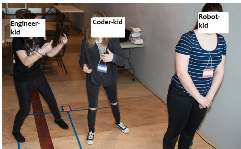
Figure 1. Secondary pupils playing the robot game

numbers, spatial awareness, movement (absolute and relative) on a grid, and differentiation of left and right.