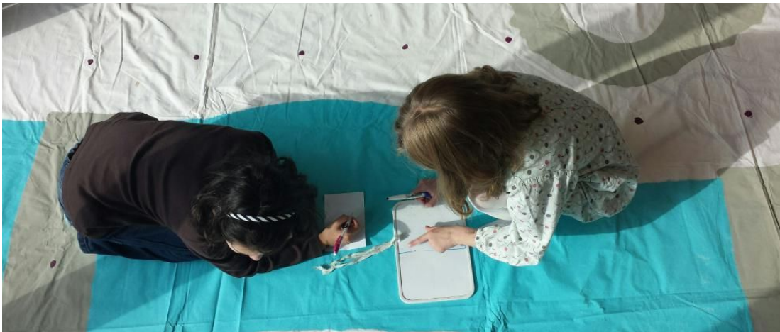
Figure 5. Designing programs for the robot.

Later on, the language can be changed to include rotations with the movements. This means that the movements become relative and the perspective is therefore changed. For the pupils playing the programmers, the programme can be made as a series of arrows, making it accessible even to children who have not yet learned to read. Once the pupils have understood the principle of writing a sequence of instructions and transmitting them to the pupil playing the robot, additional challenges can be introduced (crossing the river, getting to the woods, etc.). To vary the programs, objects can be placed at certain points in the landscape and instructions to pick up all the objects at the robot's feet can be added.