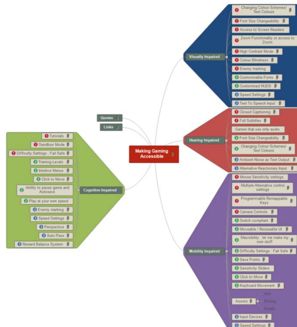
Figure 1: How to make games accessible

The focus in this paper is on visual impairment. In addition to dyslexia, it is a common impairment also for teachers, which is quite easy to address, if thought of at an early stage[11].