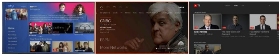
Fig. 1. Sky Q (left), Hulu (center), YouTube TV app for Roku devices (right)

Offering a device-independent proposal, YouTube launched the YouTube TV app in 2017 3 . While the app started out as a mobile solution to the new ways of watching TV or online audiovisual content, by combining live channels to its ever-growing catalog of user-generated content, YouTube TV has become a stand-alone product in its commercial offer of online and live content (see Fig. 1). As a streaming platform, the YouTube TV is becoming a key app for other devices, as it is now available for mobile, browser, or as an app for smart TVs. Highly flexible but limited to the USA, it is an ambitious product that will continue to grow.