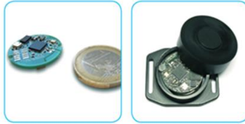
Fig. 2. VTT Tiny Node: a battery operated sensor board.

connection for the selected Tiny Node. The communication in Bluetooth is initiated by activating the stream transmission of acceleration and barometer data from the sensor to the main control software for activity analytics.