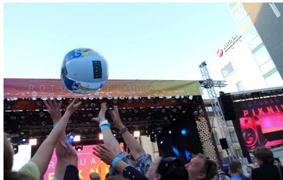
Fig. 4. Audience engagement with the raffle game.

The evaluation of the technical functionality of the system and the audience reaction to the raffle game is based on our observations. We had two researchers observing the audience reactions and the game play for each raffle round.