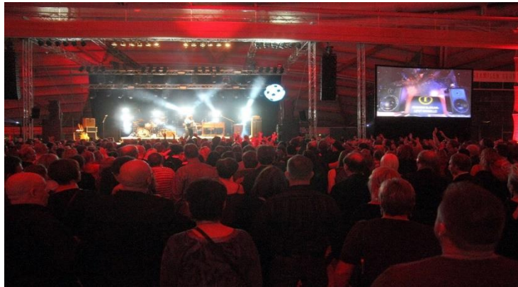
Fig. 5. Pikkujoulu Piknik context: stage, screen with the raffle game and the sensor ball

organized in a sport hall. The setup was similar: the audience in front of the stage and service points (bars, restaurants) surrounded the audience area (Fig. 5). The main difference compared to the summer festival was the absence of natural light – the evenings in July are bright in northern Finland. To overcome this challenge we used an air-filled ball with an integrated LED luminaire. The LED light ball was larger than the one used in first pilot, the diameter was more than 60 cm.