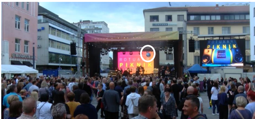
Fig. 3. Rotuaari Piknik context: stage, screen and the ball (circled in the image)

To evaluate the feasibility of our approach from technical and design viewpoints we organized two live pilots in Oulu, Finland, together with our pop festival organizer partner. First, we piloted the solution during Rotuaari Piknik, which was an outdoor festival in downtown, Oulu, in July 2016 and second, in Pikkujoulu Piknik, which was a one-day festival organized in an indoor venue, in November 2016. Our main goal was to evaluate the technical functionality of the sensor ball as an interaction mechanism and audience response to this type of an interactive application.