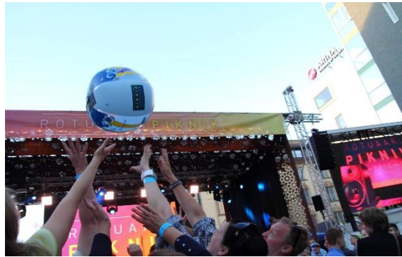
Fig. 4. Audience engagement with the raffle game.

The evaluation of the technical functionality of the system and the audience reaction to the raffle game is based on our observations. We had two researchers observing the audience reactions and the game play for each raffle round.