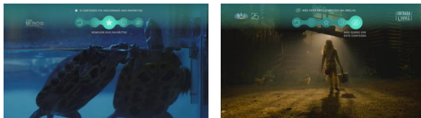
Fig. 4. Full screen menu with "Favorite" (left) and "I don't want to see this" (right) options