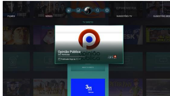
Fig. 1. Home screen interface

A unified search engine, with predictive keyboard, retrieves results from Catch-up TV and OTT sources sorted in rows, presenting labeled card-based thumbnails of the content for quick scan and access (Fig. 2).