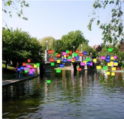
Fig. 1. Eye focus distribution collected from the eye movement data set [17,18]

This paper takes the data set [17,18] released by Massachusetts Institute of Technology as an example to analyze the key factors that affect visual attention. The data set contains 1003 images. From the content point of view, the image of the data set covers natural landscape images, human scene images, and images related to portraits, characters, animals, buildings, and so on. The researchers invited 15 people to look at the images and record the focus distribution of each person's gaze when they watched the image through an eye motion recorder. The researchers recorded each of the 15 people watching the first 5 focuses of each image. Then, these focal points in the same image are labeled, and the overall distribution of the focus of each image is gotten, as shown in Figure 1.