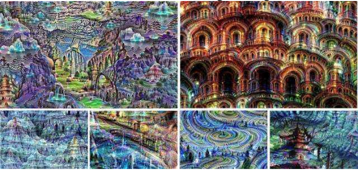
Fig. 4: The work created by the Google Deep Dream program

Therefore, we can see that no matter how artificial intelligence is trained, its foundation is the existing works, and the artistic standards obtained by quantifying and analyzing the previous works are in conflict with the essence of the continuous innovation of modern art. Since art is an ever-developing living body, artistic standards are constantly changing. Adorno proposed a standard for judging true art and cultural goods as "truth content" ([Germany] Wahrheitgestalt), [12]. The truth content is different from the true and false binary logic of computer, but is the artistic standard that has both true and false and specific content. The language of art is real, which means that it truly simulates the language of things, and truly formalizes the language logic of itself, and the language logic of art is internal and historical [13]. According to Adorno, the artistic standard is a large standard based on human imitation and true language. It can be regarded as the standard of the whole human artistic spirit. Therefore, the standards that do not take into account the evolution of artistic logic are rigid.