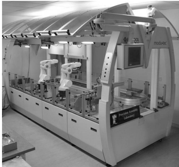
Fig. 3. The precision assembly demonstrator (PAD)

This system has been implemented in a real precision assembly demonstrator (PAD, shown in Fig. 3 ) at the University of Nottingham. The demonstrator is designed to assemble interior hinges from the automotive industry. Each product is defined by a recipe file that indicates the détente force – achieved by the configuration of ball-spring pairs added to the hinge. Because each hinge produced by the system could be unique, these recipe files are a way to formalise the batch-size of one requirements in the system.