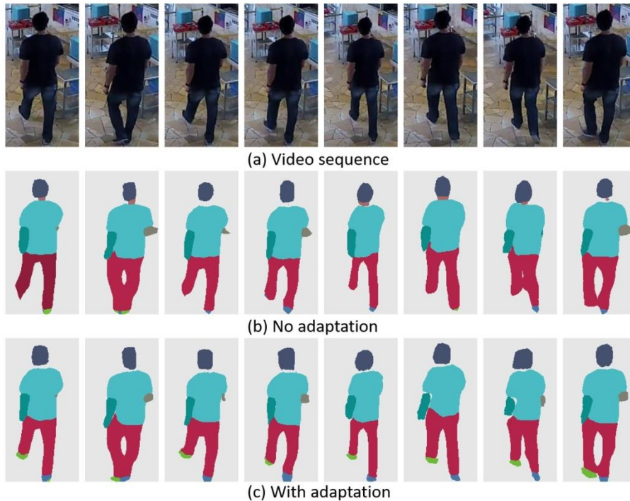
Fig. 3. Qualitative results on video sequence from target domain.

We present the comparisons of experimental results human parsing both with domain adaptation and without adaptation respectively in Figure 3. The cross-domain adaptation human parsing model can predict the details of the pictures so that these running results are more robust and adapted to the target domain. Overall, the real-time cross-domain object part segmentation system shows good performance and can be more advantageous for practical applications.