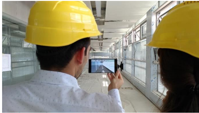
Fig. 5. Using the AR4C prototype application.

In this case, context-awareness, is achieved with respect to two dimensions: location and time. The Figure 5. shows a demonstrative utilization of the application in the Fraunhofer offices, when they were still a construction site.