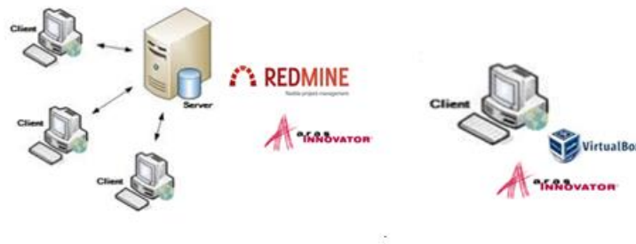
Fig. 2. Architecture software

For the implementation and development of practices, it is necessary to set up an infrastructure allowing the student to interact with the different tools in a collaborative framework through two main systems: a production system that allows students to work in a collaborative environment for the implementation project and a development system, through a virtual machine in each student machine for developing and testing solutions. Previous implementation in the productive system (figure 2).