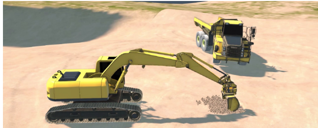
Fig. 2.: An excavator model operating on deformable ground

Multibody real-time simulation techniques have enabled the precise description of complex mechanical systems such as mobile and industrial machinery and the subsequent solution of the relevant equations of motion in real time. This capability has been available for more than three decades. Currently, real-time simulation models based on multibody dynamics can account for a large number of rigid [Garcia de Jalon et al., 1994] and flexible bodies [Garcia de Jalon et al., 1994], and contact models [Garcia de Jalon et al., 1994]. These multibody-based approaches can be combined with models of actuators enabling the description of multi-physical systems as the one shown in Figure Fig. 2.