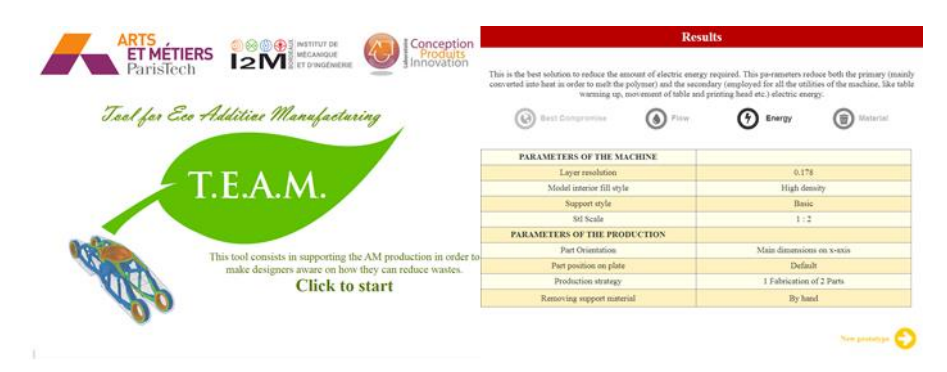
Fig. 3. Welcome page and results pages with Axure

First comparison of the two versions. One difference between the two developed versions of TEAM was the feedback of the data fulfilment on the navigation page. With POP, it was represented by two lines summary in the bottom of the page. With Axure, the user went back to a summary page called "your prototype" every time he defined a preference. This decision of implementation has been supported by considering the already existing apps and noticing that the use of the line for showing the preferences defined concerns mainly the web site design.