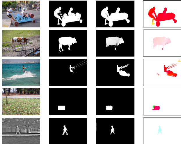
Fig. 3. From left to right: one image from the video, binary ground truth, motion saliency maps predicted by our method MSI-ns, and the estimated forward residual flow (displayed with the motion colour code of Fig. 2).

There is no available benchmark dedicated to motion saliency. Therefore, we choose the DAVIS 2016 dataset for the evaluation of our method. This dataset has been initially introduced in [20] for the video object segmentation (VOS) task. It has also been recently used to evaluate methods estimating saliency maps in videos, as in [9, 10]. For the VOS task, the object to segment is a foreground salient object of the video, which has a distinctive motion compared to the rest of the scene. It makes this dataset exploitable for motion saliency estimation, although appearance plays a role.