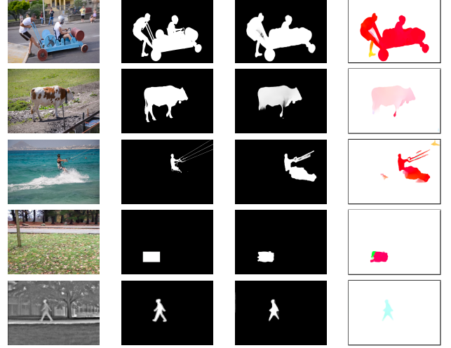
Fig. 3. From left to right: one image from the video, binary ground truth, motion saliency maps predicted by our method MSI-ns, and the estimated forward residual flow (displayed with the motion colour code of Fig. 2).

There is no available benchmark dedicated to motion saliency. Therefore, we choose the DAVIS 2016 dataset for the evaluation of our method. This dataset has been initially introduced in [20] for the video object segmentation (VOS) task. It has also been recently used to evaluate methods estimating saliency maps in videos, as in [9, 10]. For the VOS task, the object to segment is a foreground salient object of the video, which has a distinctive motion compared to the rest of the scene. It makes this dataset exploitable for motion saliency estimation, although appearance plays a role.