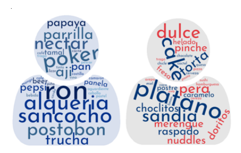
Fig. 7. Food related words by gender (men and women)

When the differences at the gender level are observed, there is a tendency of men towards the mention of alcoholic beverages, such as wine, drink and beer; whereas in women, terms such as desserts, sweets, milkshakes and chocolates, are more frequent. That is, a pronounced tendency was found in women towards mentioning sweets; nevertheless, the mention of fruits by them, is also evident. These results are presented in the word clouds of figure 7.