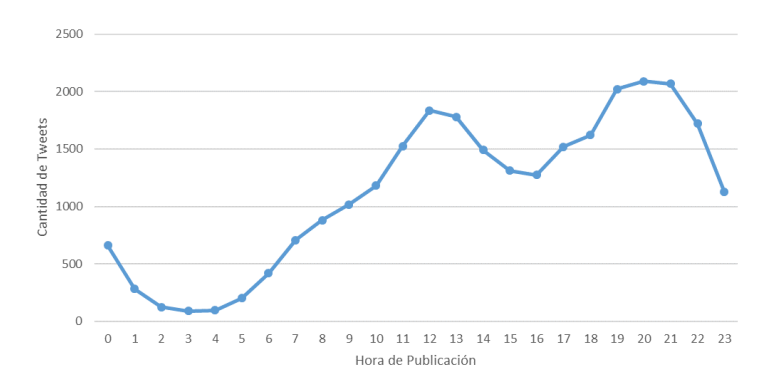
Fig. 6. Publication Frequency Distribution of tweets according to publication time

In relation to the sociographic variables, emotion is detected for 40 percent of the tweets and polarity for 86.1 percent. When performing the individual analysis of the most frequent words and their relationship with the emotion of the tweet, it is observed (see table 2) that words like cake, cocktail, hot drink, wine and avocado, have a high participation with tweets related to joy. On the other hand, words like dinner, pizza and chicken, have shares in sadness exceeding 20 percent of the tweets.