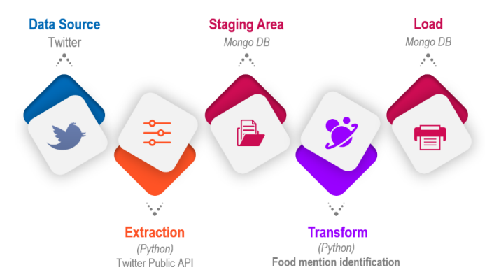
Fig. 4. ETL implementation design.

is used as data source, which is extracted using its public API<sup>1</sup> implementation, in Python<sup>2</sup>.