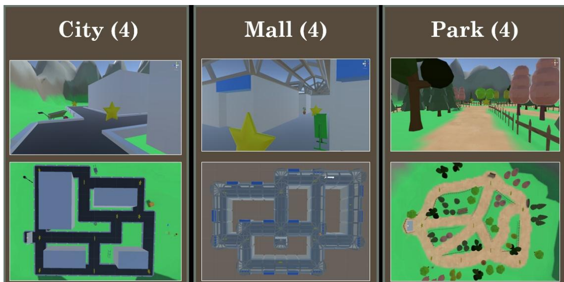
Figure 1. First-person view and bird's-eye view of the three virtual environment styles. For each style, we created 4 exemplars, though only one from each is shown here. The Stars are visible in the environments during encoding, but not during retrieval. Participants only experienced the environments from a first-person perspective.

VR equipment. The VR program was run on an Asus© Zenfone 3 Laser™ (see specificities on www.asus.com , Asus, Taipei, Taiwan) and a lightweight hand-held cardboard VR headset for viewing. The VR application run on the Android phone was designed using the 3D engine Unity© (ver. 2017.2.0.f3, Unity Technologies ApS, San Francisco, CA, USA). Twelve virtual environments (VE) were built according to three styles of: city streets, mall hallways, and park trails (see Figure 1 for samples). The virtual environments were topographically similar, with an average area of 234 square meters. Additionally, each environment had six intersections, which is a point where 3+ roads converge.