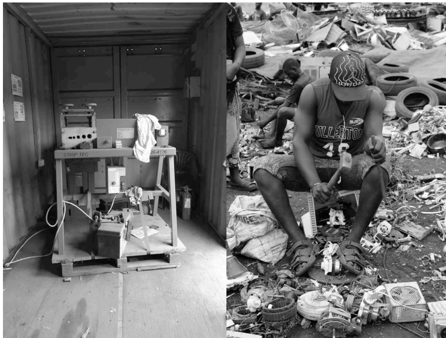
Fig. 3. Cable stripping machine (left) and electronics recycling (right) in the Agbogbloshie scrap metal yard

Meet Agbogbloshie, a large scrap metal yard in Accra, Ghana, where I implemented fieldwork on repair and recycling as part of my research on the life cycle of mobile phones. Agbogbloshie is the place where cars, machines, and condemned electronics, such as mobile phones, are recycled. Non-metals parts that cannot be recycled, remain behind as untreated waste or are used as ‘fuel’ for the burning of cables that contain copper.