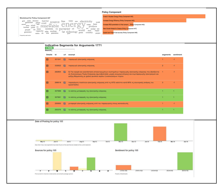
Fig. 2. Results visualization of the "Energy" pilot application of the passive citizen-sourcing method

With respect to the passive citizen-sourcing method outlined in 3.2 three pilot applications have been conducted, in co-operation with the Greek and the Austrian Parliament, and the European Academy of Allergy and Clinical Immunology (EAACI), on topics that reflect important current debates and interests of these organizations. In Fig.2 we can see a visualization of the results derived in one of these pilot applications, concerning the energy policy.