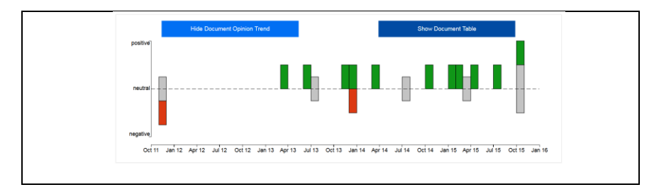
Fig. 3. Results visualizations of the passive expert-sourcing method

From this evaluation has been concluded that this passive expert-sourcing method has high levels of usefulness for the collection of high quality information and knowledge concerning all main elements of important social problems that have to be addressed through public policies: particular issues, proposed actions/interventions, advantages and disadvantages of them. Therefore it can make a significant contribution, and more multi-dimensional than the other two abovementioned citizen-sourcing methods, towards addressing the fundamental difficulty of modern policy-making: highly complex and 'wicked' social problems to be addressed [1-2], with many issues, proposed actions/ interventions, with each of them having various advantages as well as disadvantages, and also multiple stakeholder groups with differing views and perceptions about them. Furthermore, this method has medium to high levels of usefulness for identifying existing attitudes/sentiments in the society towards the above main elements of important social problems under discussion, as well as their time wise change.