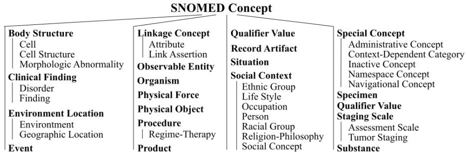
Fig. 2. SNOMED meta-concept layer integrated to include the semantic tags hierarchy.