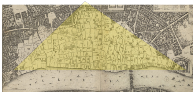
Fig. 1. Extract from “An exact survey of the streets, lanes and churches contained within the ruins of the city of London”, map of John Leake (1667) . Theorem 1 shows that in a city with a regular quadrangular map, the fire propagates according to a deformed L_1 (weak-)ball. Even in a city like 17th century London, which is only roughly quadrangular, the propagation is approximately polyhedral (a deformed L_1 ball is superposed in yellow, to be compared with the final extension of the fire). Note that the approximation is incorrect at the North-West and West of London, owing to the presence of the wall of London and to other factors.

great 1666 fire shows that even in less regular cities, with only an approximately quadrangular street organisation, the “deformed L_1 ball” is still visible (Figure 1). We also present in Section 4 simulations regarding the Kobe fire following the earthquake of 1995. The earthquake broke the fire hydrants and, so, there were few resources available to limit the propagation of the fire during the first hours, making of Kobe data a suitable case study to validate our model. We shall see that the deterministic model allows us to reproduce in an accurate way historical data. Surprisingly, the results obtained from the deterministic model are sometimes more accurate than the ones obtained by a stochastic CA model (stochastic models tend to “round” the deformed L_1 ball which does appear on historical data, see Figure 3). This suggests that in an urban area fire propagation has some deterministic features. Whereas certain conditions, like the location and time of the initial ignition sources, are inherently random, deterministic propagation to nearest neighbours is a dominant factor.