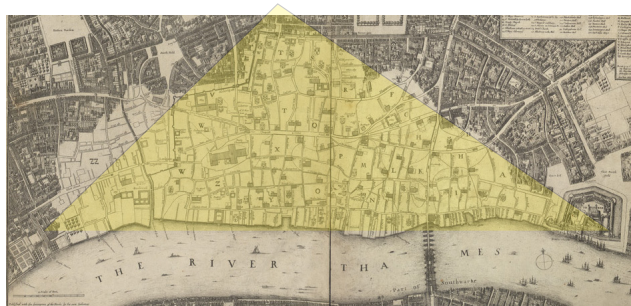
Fig. 1. Extract from “An exact survey of the streets, lanes and churches contained within the ruins of the city of London”, map of John Leake (1667), source www.bl.uk/onlinegallery . Theorem 1 shows that in a city with a regular quadrangular map, the fire propagates according to a deformed L_1 (weak-)ball. Even in a city like 17th century London, which is only roughly quadrangular, the propagation is approximately polyhedral (a deformed L_1 ball is superposed in yellow, to be compared with the final extension of the fire). Note that the approximation is incorrect at the North-West and West of London, owing to the presence of the wall of London and to other factors.

great 1666 fire shows that even in less regular cities, with only an approximately quadrangular street organisation, the “deformed L_1 ball” is still visible (Figure 1). We also present in Section 4 simulations regarding the Kobe fire following the earthquake of 1995. The earthquake broke the fire hydrants and, so, there were few resources available to limit the propagation of the fire during the first hours, making of Kobe data a suitable case study to validate our model. We shall see that the deterministic model allows us to reproduce in an accurate way historical data. Surprisingly, the results obtained from the deterministic model are sometimes more accurate than the ones obtained by a stochastic CA model (stochastic models tend to “round” the deformed L_1 ball which does appear on historical data, see Figure 3). This suggests that in an urban area fire propagation has some deterministic features. Whereas certain conditions, like the location and time of the initial ignition sources, are inherently random, deterministic propagation to nearest neighbours is a dominant factor.