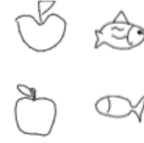
Figure 3: Average reconstruction errors of the Sinkhorn, Hellinger, and KDE estimators on the Google QuickDraw reconstruction problem. On the right, a mini-sample of the dataset.

size k . As can be noticed, the sharp Sinkhorn consistently outperforms its regularized counterpart. Interestingly, this improvement is more evident for measures with sparse support and tends to reduce as the support increases. This is in line with the remark in example Example 1 and the fact that the regularization term in \tilde{S}_\lambda tends to encourage oversmoothed solutions.