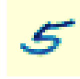
Figure 4: (Right) Relative error (see text) for the Sinkhorn estimators on the digit reconstruction problem. (Left) Sample predictions for egularized (First image) and sharp Sinkhorn estimators.

diverse shapes, to disregard any legitimate vagueness. This means that any classification errors will be due to a poor prediction of the lower half.