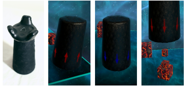
Figure 3: Illustration of the Dice Cup metaphor. From left to right, tracked tangible cup, grab operation, release confirmation after shaking the cup and lift of the cup revealing the stacked objects.

Object Grab. Grabbing an object is achieved by covering the