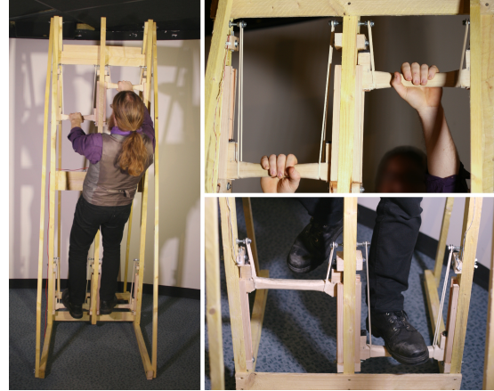
Figure 1: Left, the VladdeR , a tangible interface for Virtual ladder climbing. Right-up, the hands rungs. Right-down, the feet rungs.

Climbing task control. In the user's resting position, all four rungs are brought down and the virtual hands and feet of the user are attached to their respective virtual rungs. When the user releases a