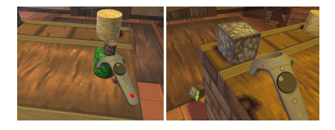
Figure 3: Physical object manipulation (left) with frame recording as indicated by the red round on the controller and time control (right), the green arrow indicates the object velocity, the pad can be rotated to navigate in the time-line as shown by the blue slider on the controller

The first step of physics-based manipulation is to be able to select an object. Such selection is possible when a controller intersects an object. The object turns green if it can be manipulated. In that case the user can press the trigger of the corresponding controller to grab