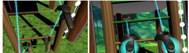
Figure 1: First person point of view of the ladder climbing. The user is observing either his/her feet (left) or his/her hands (right).

We propose a puppet metaphor that allows to control the feet and the hands through two Vive controllers. For this purpose, the users have the possibility to control their limbs as they would control a puppet. Nevertheless, they are not immersed in an out-of-body situation, but remain in a first-person point of view. The position of their head is tracked using the Vive HMD and 3D models of the controllers map the real controllers position and orientation in the VE. We differentiate these controllers in the VE with the actual virtual hands and feet. Such virtual hands and feet are moved by the user over the ladder and are considered as being the puppet