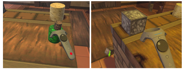
Figure 3: Physical object manipulation (left) with frame recording as indicated by the red round on the controller and time control (right), the green arrow indicates the object velocity, the pad can be rotated to navigate in the time-line as shown by the blue slider on the controller

The first step of physics-based manipulation is to be able to select an object. Such selection is possible when a controller intersects an object. The object turns green if it can be manipulated. In that case the user can press the trigger of the corresponding controller to grab