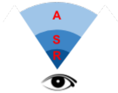
Figure 2: Zones of visibility in the field of agent’s vision. Zone marked ‘R’ is Reach, ‘S’ is See and ‘A’ is Appear.