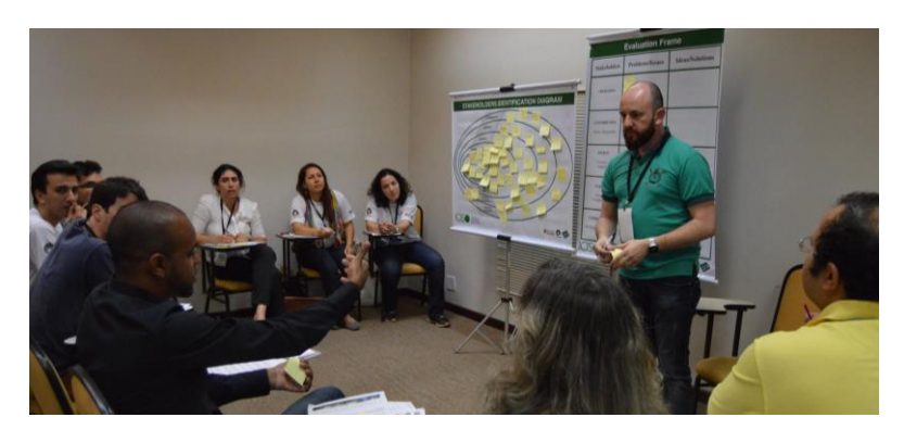
Fig. 1. Group discussion during the first workshop: SID (left) and EF (right).

The first workshop resulted in the identification of stakeholders and related problems and solutions. One of the SIDs shows a general concern with safety: smoke detectors, earthquake alarms and security cameras were some of the ideas for the source information layer of SID. The other SID layers from the first workshop had many contributions directed to pets: pet's cage and accessories (contribution layer), health insurance for pets (source layer) and animal welfare department (community) are some of the results. Fig. 1 illustrates a moment from the first workshop.