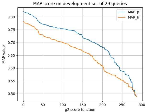
Figure 5: MAP results on the development set for 288 variants of the score function.