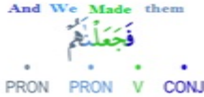
Figure 1: Example of the Arabic language difficulties: the tokenization problem.