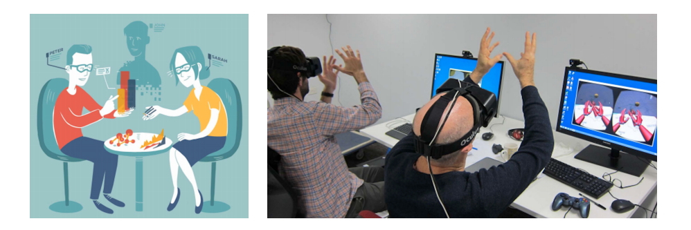
Fig. 1: The research field of immersive analytics is exploring techniques that will enable seamless local and remote collaborative work informed by data in immersive environments. While the ideal technologies are not yet quite available (left), researchers can already explore the design space and develop the necessary display and interaction techniques using existing technologies (right). (Figure \bigcirc 2015 IEEE. Reprinted, with permission, from Chandler et al. [16]).

true for business analysts, scientists, and policymakers, but also for members of the general public who have increasing access to, for instance, personalised health data, IoT and other sensor data, as well as social media. In recent years we have seen rapid progress in the development and availability of immersive technologies such as head-mounted Virtual and Augmented Reality (VR and AR), large wall-mounted, hand-held, or wearable displays. Similarly, progress in sensor technology and the application of machine learning technologies to interpret user gestures and utterances have fuelled the development of natural interfaces making use of speech, gesture and touch. The combination of these new kinds of display and interaction technologies is building towards a(nother) revolution in how people use computers and offers a new approach to data analytics and decision making; one that liberates these activities from the office desktop and supports both collocated and remote collaboration (see Figure 1).