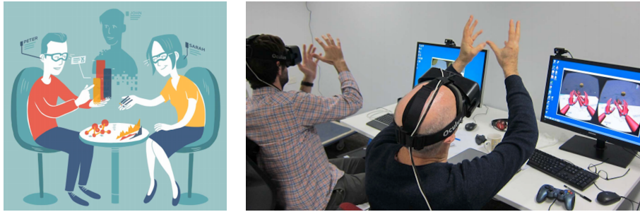
Fig. 1: The research field of immersive analytics is exploring techniques that will enable seamless local and remote collaborative work informed by data in immersive environments. While the ideal technologies are not yet quite available (left), researchers can already explore the design space and develop the necessary display and interaction techniques using existing technologies (right). (Figure © 2015 IEEE. Reprinted, with permission, from Chandler et al. [16]).

true for business analysts, scientists, and policymakers, but also for members of the general public who have increasing access to, for instance, personalised health data, IoT and other sensor data, as well as social media. In recent years we have seen rapid progress in the development and availability of immersive technologies such as head-mounted Virtual and Augmented Reality (VR and AR), large wall-mounted, hand-held, or wearable displays. Similarly, progress in sensor technology and the application of machine learning technologies to interpret user gestures and utterances have fuelled the development of natural interfaces making use of speech, gesture and touch. The combination of these new kinds of display and interaction technologies is building towards a(nother) revolution in how people use computers and offers a new approach to data analytics and decision making; one that liberates these activities from the office desktop and supports both collocated and remote collaboration (see Figure 1).