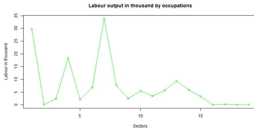
Fig. 1. Number and distribution of managerial position by sectors

As a consequence the technological impact on the demand side of labor market implies structural changes of required competencies. Educational institutes need time to change their educational portfolio due to the lead-time of formal education. A system, which is capable to predict the future occupational structure and conclude to the required competencies, can facilitate decision making processes both in the educational institutes and in the world of labor.