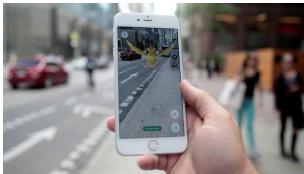
Fig. 1: Pokémon Go on iOS [5]