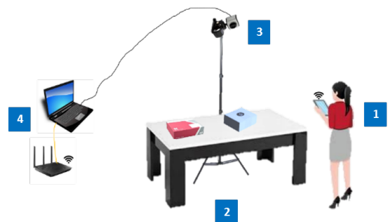
Figure 2: The overall setup of our Mixed Reality demonstrator.

The main goal of our demonstrator is to achieve probeless and realistic augmentations of the real scene. The considered scenario is the following (Fig. 2):