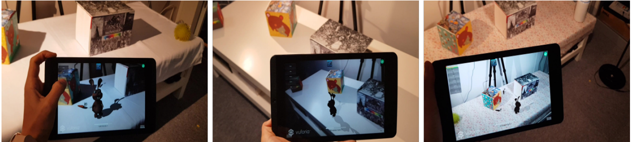
Figure 1: Captures of our Mixed Reality (MR) application for real scenes with a uniform and Lambertian surface (left), a uniform and specular surface (center) and a challenging textured surface (right). The lighting condition can be changed within the MR experience.