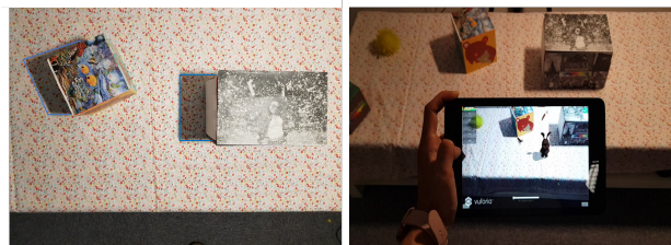
Figure 4: Left: Superimposed contours (blue) of the matched shadows (viewed from static camera). Right: User view of the augmented scene through the tablet.

captured image as follows: first, we detect cast shadows on the principal planar surface [4]. Then, we correlate the image of detected shadows with a set of precomputed shadow maps. Recovered light sources correspond to shadow maps with high correlation values (Fig. 4). Finally, we recover the intensity of the selected light sources using a Least Squares estimator [3].