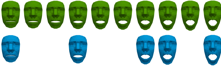
Fig. 3. Estimated geodesic regression. Top row: the estimated trajectory. Bottom row: observations from which the top trajectory is learned.

user-specified parameter \sigma_\epsilon . Note that the trajectory t \mapsto \Phi_{q,t\mu} \star T is the action of a geodesic on the q -manifold of diffeomorphisms onto the template shape T .