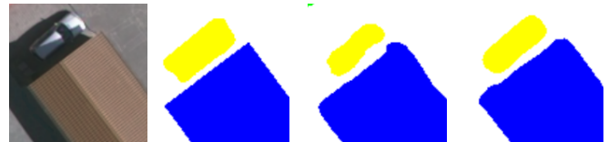
Fig. 2. Results from zoomed area of validation image depicting area 15. (from left to right) the original image, the ground truth, the predictions of SegNet and Stacked Hourglass Networks are shown.

Comparing to SegNet, Stacked Hourglass Networks managed to locate cars with much more detail. In Figure 1, a zoomed region of area 12 and area 4 of the ISPRS testing images is presented as an example. One can observe that the exploited architecture can detect cars even if they are in shadowed places with a very high accuracy. More specifically, for this specific testing area, the overall pixel-wise car accuracy