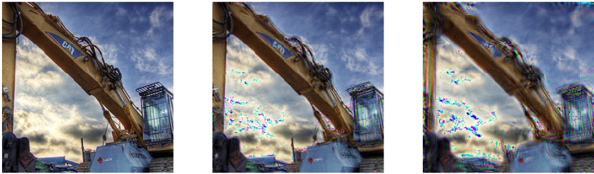
(a) middle: PSNR \approx 26dB , right: PSNR \approx 20dB