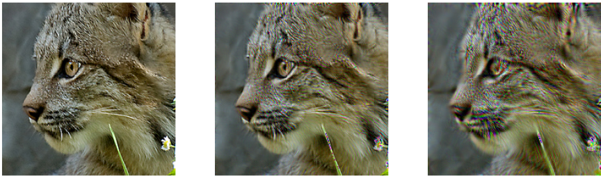
(b) middle: PSNR \approx 23dB , right: PSNR \approx 19dB

Fig. 1: Reconstructed images from first-order scattering coefficients, J = 3, 4 and their PSNR. Color channels can be slightly translated leading to artifacts. ( left ) original image x ( middle ) reconstruction \tilde{x}_3 from Sx , J = 3 ( right ) reconstruction \tilde{x}_4 from Sx , J = 4 . This demonstrates that even complex images can be reconstructed for J = 3 , while dividing the spatial resolution by 2^3 .