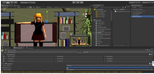
Fig. 3. The avatar and the interface of Unity3D