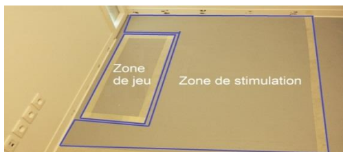
Fig. 5. Scene of interaction

When one of these three events is recognized, it is sent immediately to the IM so that the last one could determine the interaction with the user.