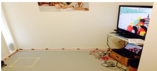
Fig. 4. Private room equipped the interactive system and a HD display

Thanks to this list, we can imagine several scenarios that could decide a right time to interact with the person. The event models are described by using a descriptive language allowing to define the spatial-temporal constraints between different states and events. Here is an example of the definition of an event :