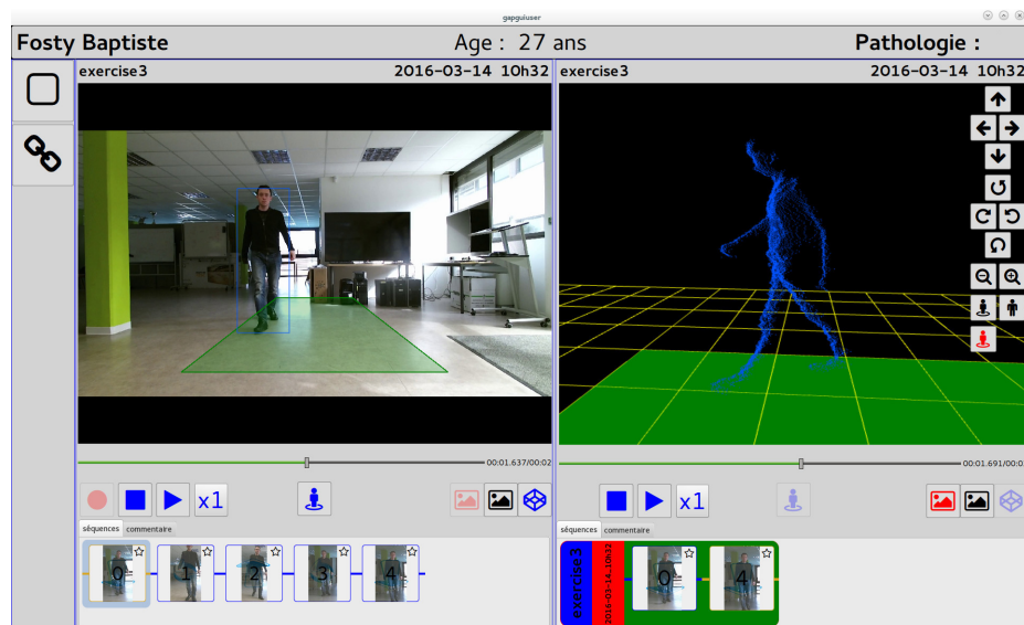
Figure 2: Screenshot of the interface for rehabilitation application. Top : patient general information. Left image : color image of the camera. Right image : 3D side view of the cloud of point of the person. Bottom (thumbnails) : sequences detected in the video.

Following that, we decided to study whether this system would be useful in rehabilitation. Some experts of this domain in a rehabilitation center (Centre Hélio Marin in Vallauris, France) have been interviewed and they were very enthusiasts about using this type of system to get objective gait parameters. In collaboration with them, we started to develop a proper application for rehabilitation, adding new fonctionnalities around gait parameters computation such as side-by-side video comparison, automatic sequencing of video or 3D display (see Figure 2).