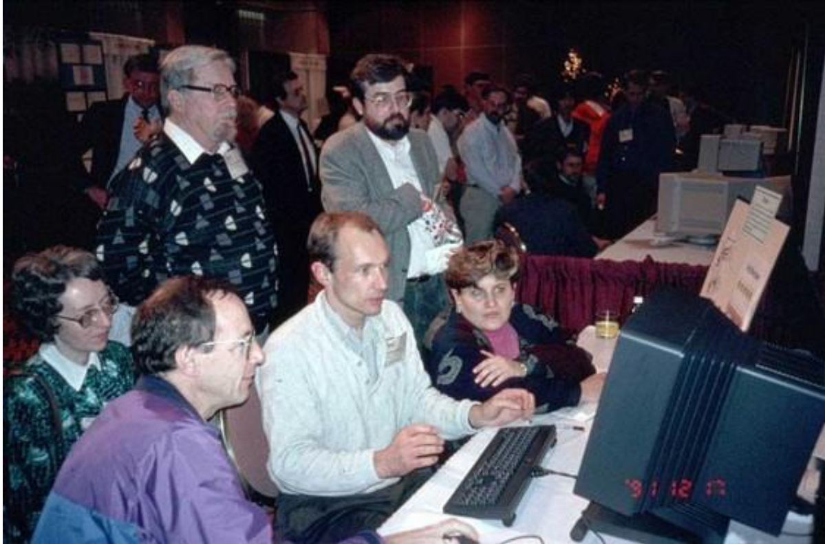
Tim Berners-Lee demonstrating the World Wide Web at the 1991 Hypertext Conference, San Antonio, Texas.

In Tim's proposal, hypertext has been liberated from the central server: the data and links are decentralized on the Internet. In addition, the links are unidirectional and are no longer necessarily maintained: the 404 error was born. This rupture with respect to the fundamental aspects of hypertext is what Ted Nelson was referring to in the citation at the beginning of this section, and it also explains why Tim's submission to the third ACM Hypertext conference in 1991 was only accepted as a demo. However, these breaks from what had previously existed were the necessary conditions for allowing passage to the scale and virality of the Web. In addition, a certain number of the changes that came with the Web concerning hypertexts led to the creation of major Web applications and services. For example, the absence of a central index and of bidirectional links would lead to the creation of directories (e.g., Yahoo! in 1994) and search engines (e.g., Altavista, Google) to locate pages and links. And, looking at it closely, pages such as those generated by search engine results now make up a substantial part of the Web we browse.