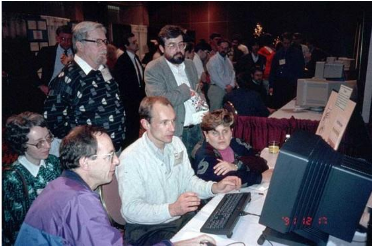
Tim Berners-Lee demonstrating the World Wide Web at the 1991 Hypertext Conference, San Antonio, Texas.

In Tim's proposal, hypertext has been liberated from the central server: the data and links are decentralized on the Internet. In addition, the links are unidirectional and are no longer necessarily maintained: the 404 error was born. This rupture with respect to the fundamental aspects of hypertext is what Ted Nelson was referring to in the citation at the beginning of this section, and it also explains why Tim's submission to the third ACM Hypertext conference in 1991 was only accepted as a demo. However, these breaks from what had previously existed were the necessary conditions for allowing passage to the scale and virality of the Web. In addition, a certain number of the changes that came with the Web concerning hypertexts led to the creation of major Web applications and services. For example, the absence of a central index and of bidirectional links would lead to the creation of directories (e.g., Yahoo! in 1994) and search engines (e.g., Altavista, Google) to locate pages and links. And, looking at it closely, pages such as those generated by search engine results now make up a substantial part of the Web we browse.