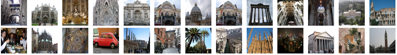
Figure 3. Examples of anchor images selected by the proposed method for the image retrieval application. Random samples from the top 100 (1000) anchors are shown in the top (bottom) row according to the node importance.