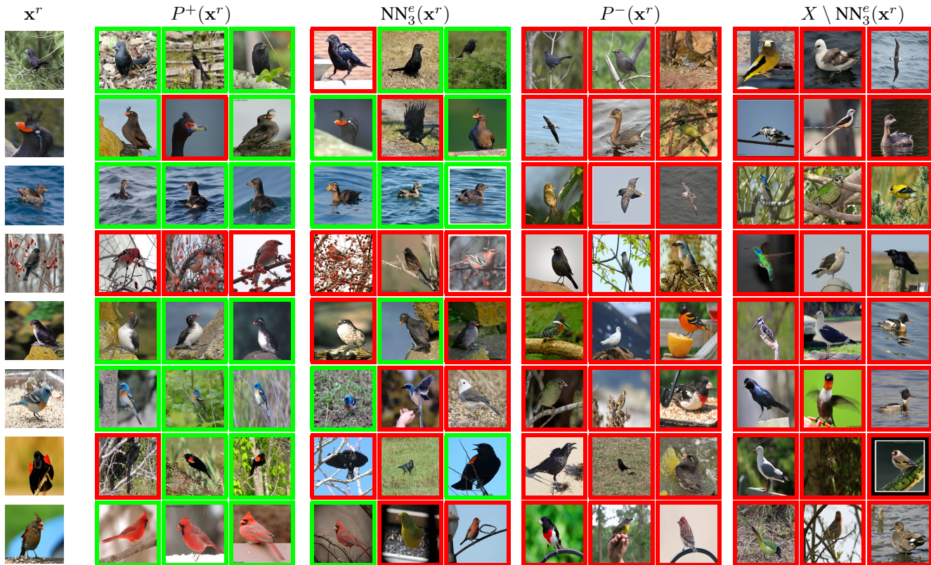
Figure 2. Sample CUB200-2011 anchor images ( \mathbf{x}^r ), positive images from our method ( P^+(\mathbf{x}^r) ) and baseline ( NN_3^e(\mathbf{x}^r) ), and negative images from our method ( P^-(\mathbf{x}^r) ) and baseline ( X \setminus NN_3^e(\mathbf{x}^r) ). The baseline is Euclidean nearest neighbors and non-neighbors [16]. Positive (negative) ground-truth framed in green (red). Labels are only used for qualitative evaluation and not during training.

and so on. In this case, given current parameters \theta , the set Z = \{f(\mathbf{x}; \theta) : \mathbf{x} \in X\} plays the role of Y for the following iteration. This alternating training scheme is common for methods involving a global dataset structure like a graph or a set of clusters [44, 4, 68]. Our idea is orthogonal to most concurrent improvements on metric learning.